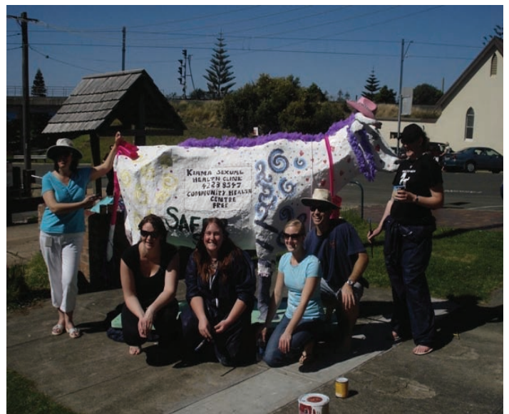
Kiama Sexual Health Clinic