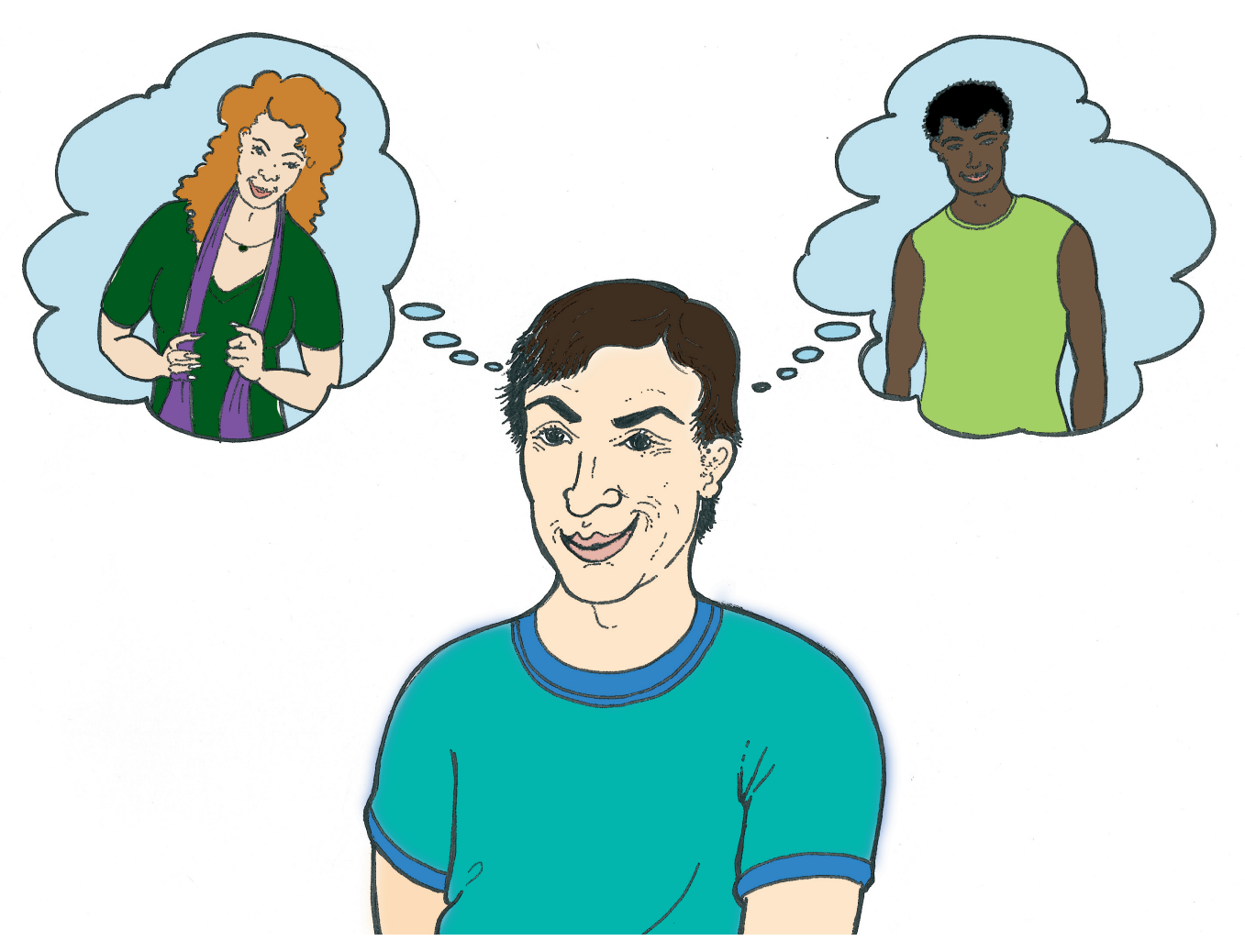
In this picture the man is thinking about a man and a woman he is attracted to. He is bisexual.

A bisexual person has sexy thoughts and feelings about other men and women. Some people may like both men and women but are not sure if they are bisexual. That is OK.