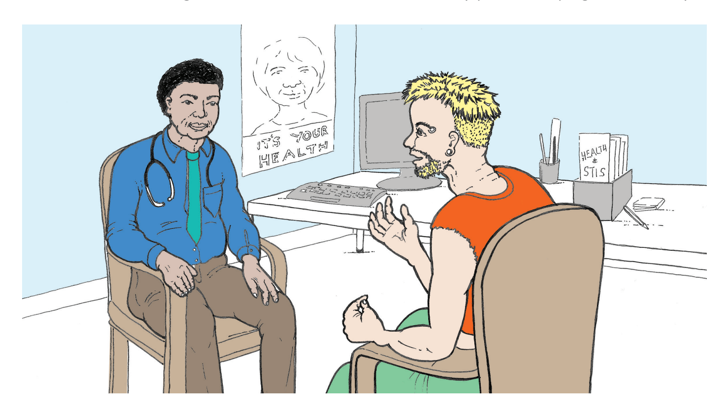
In this picture a man is talking to his doctor. He is getting a sexual health check.

For more information go to the fact sheet called 'Private body parts – keeping them healthy'.