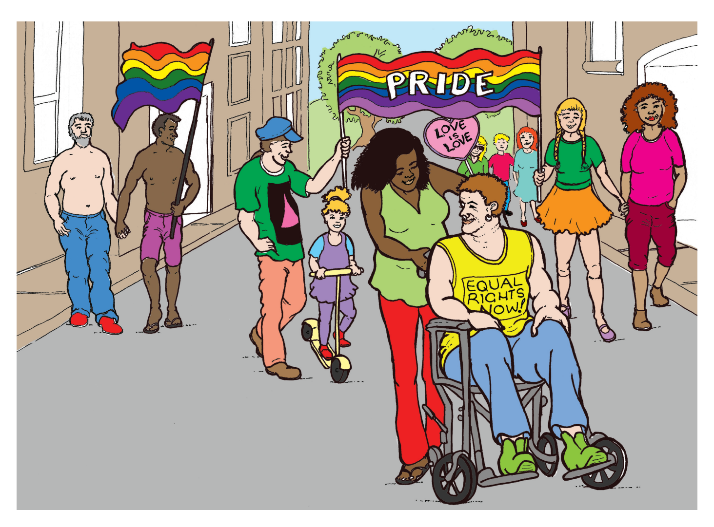
In this picture people from the rainbow community are walking down the street with rainbow flags. They are also holding signs saying 'Pride', 'Love is love' and 'Equal rights now'.

Some gay men do not know other gay men to talk to. They might feel alone and that they are the only gay person. This is not true. There are lots of other gay men. This is called the 'gay community'. The community also includes lesbian, bisexual and transgender people. Some people call this community the 'rainbow community'.