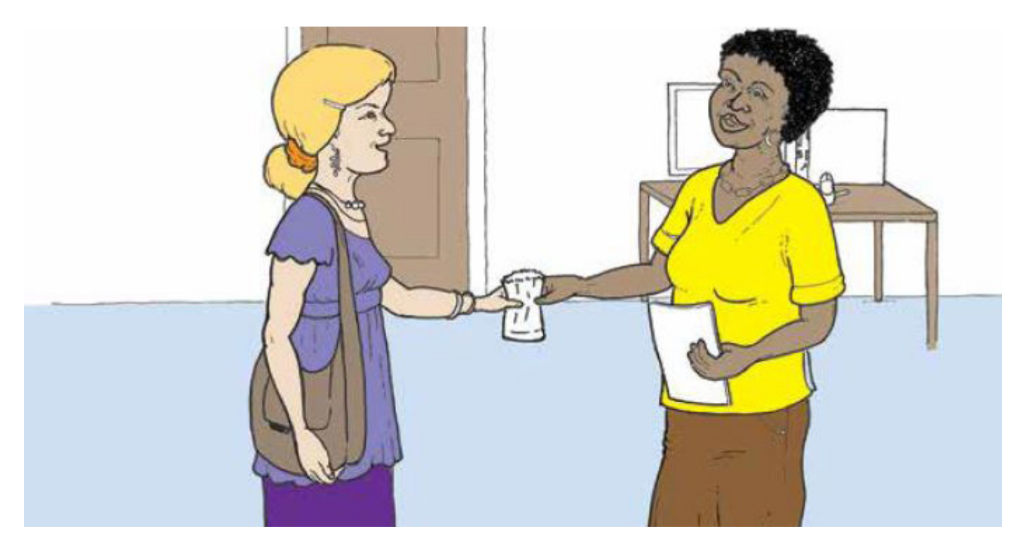
In this picture a woman is giving the jar with her wee in it to the doctor. The jar is in a paper bag to keep it private.