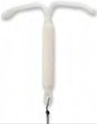
Figures 1a and b. a (left). Copper-bearing intrauterine device. b (right). Levonorgestrelreleasing intrauterine system.