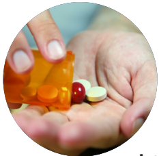
Treatments: The basics

Many medical services are free of charge if you have a Medicare card. This is called "bulk billing". If you do not have a Medicare card, call your nearest Sexual Health Service to find out what help you can get.