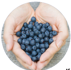
Looking after yourself

Medical information can be hard to understand if English is not your first language. Interpreters can help with this. When you make an appointment, say that you will need an interpreter.