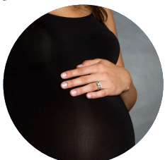
Pregnancy and me

If you need an interpreter to talk to these services, call the Translating and Interpreting Service (TIS)